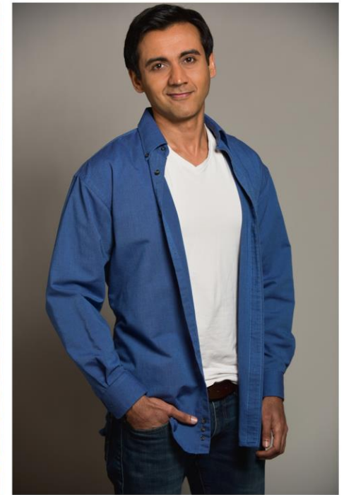
6' suit 38R shirt 15/32 waist 30 inseam 32 shoe 10 hair black eyes brown